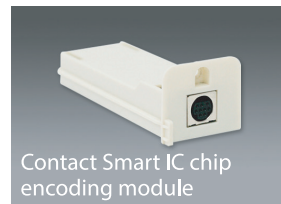
Contact Smart IC chip encoding module