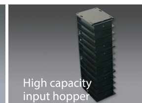
High capacity input hopper