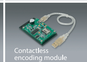
Contactless encoding module