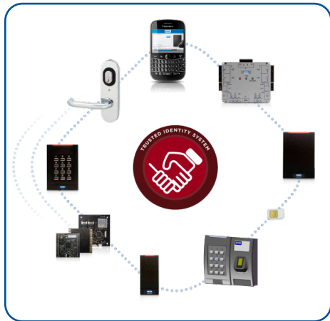
iCLASS SE® Platform