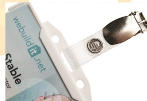
Clips and pins