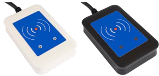
Desktop version (inlay customizable)

Elatec's TWN4 family of transponder readers and writers allows users to read and write to almost any 125 kHz, 134.2 kHz and 13.56 MHz tags and/or labels – it supports all major transponders from various suppliers like ATMEL, EM, ST, NXP, TI, HID, LEGIC, etc. and ISO standards like ISO14443A/B (T=CL), ISO15693, ISO18092 / ECMA-340 (NFC).